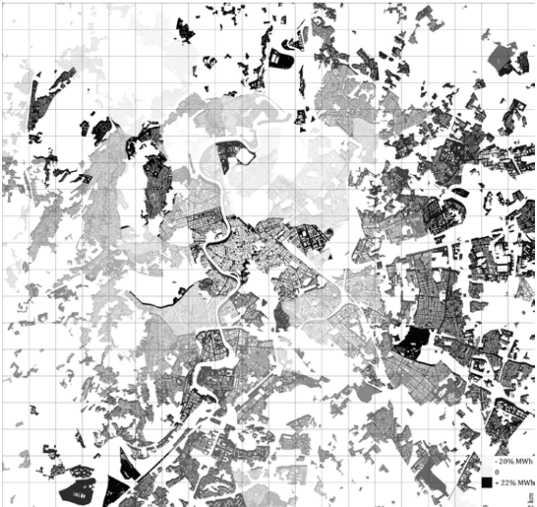
Fig. 4 - Energy consumption and Climate Change. The city of Rome is increasingly affected by heat waves and urban heat islands, the effects of which lead to intensive use of cooling devices and consequently to electrical peaks and blackouts. The map represents urban areas based on the percentage increase in electricity consumption during summer, ranging from the most intense (black) to the least intense (white).