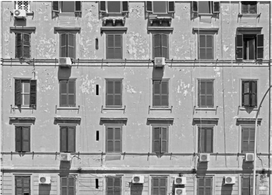
Fig. 1 - Historical, dense, worm, energy hungry, EU cities are facing several challenges for energy transition

By building on the concept of energy sufficiency and attempting to transcend it when it is restrictive – for example, when it implies a moral judgement and contours of dismal degrowth – this study aims to contribute to the repair motion as an alternative to the techno-authoritarian urban project of sustainability. In this sense, the insistence is not on replacing the socio-technical apparatus, nor even on fixing it – both of which are susceptible to insisting on the status quo of practices, policies and socio-spatial organisation.