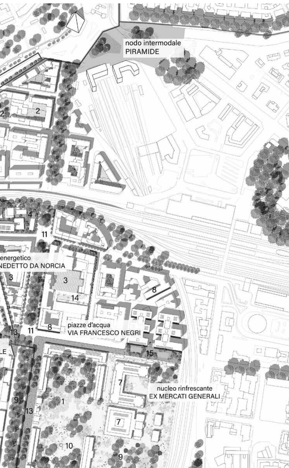
Fig. 5 - 'Bioclimatic Ostiense', a design speculation to ground different bioclimatic devices and new energy solutions (Source: Giordana Panella and Giancarlo Scarascia Mugnozza, 2023).