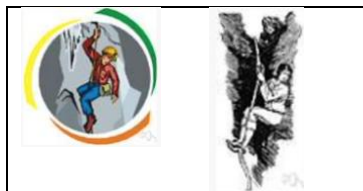
Figure 5. Images for abseil in The Free Dictionary

The creation of a multimodal and multimedial e-dictionary is a challenging task for a number of reasons. First, hyperlinks 'age' over time: the longer they exist on the web, the more they deteriorate and eventually become inactive or inaccessible. Therefore, they need to be constantly checked and substituted when necessary. This is a very time-consuming and laborious process that requires significant amounts of (financial) resources and efforts. Second, the availability of images and videos is usually subject to copyright, i.e. lexicographers are not free to utilize materials taken from other sources without obtaining prior permission. This explains why simple (black and white) drawings are sometimes used to illustrate lemmas. Figure 5 shows two images in The Free Dictionary (Note 20) for the word abseil .