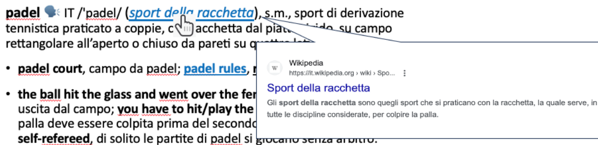
Figure 3. Definition section for padel and external link to Italian Wikipedia

The definition section of the entry should also come with the pronunciation of the word in the target language (and potentially with audio clips too) and with hyperlinks to external pages in Italian (Figure 3). This would eventually result in the creation of a bidirectional entry to be consulted to a certain extent by English- and Italian-speaking users alike.