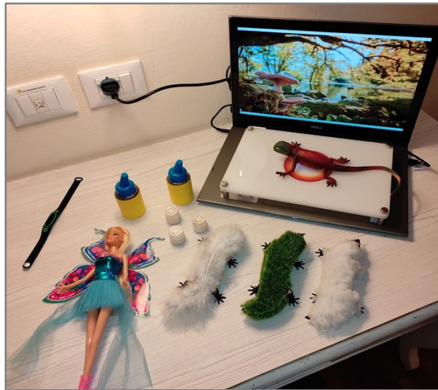
Figure 1: A picture of our TUI prototype

three jars with smells (apple, soap, burnt), two candy containers (one with cherry and one with strawberry candies).